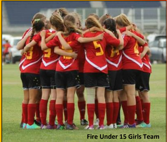
Fire Under 15 Girls Team

This is a great achievement for all the players and an excellent reflection on the junior program at our Club. In total, more than 30 Fire players across the boy's and girl's programs have been selected to trial for State Teams.